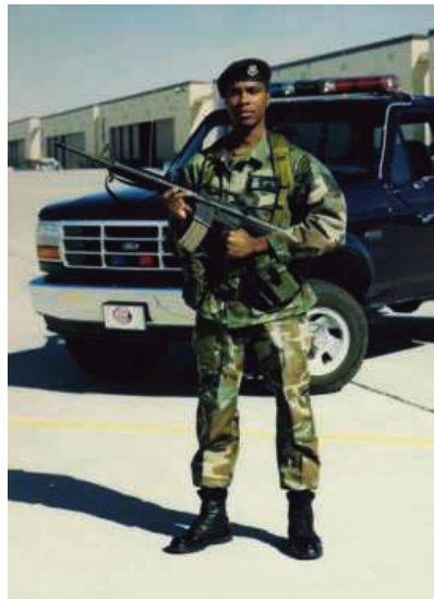
Proper security is essential for maintaining WSSRs.

WSSRs are implemented through a combination of mechanical means, security procedures, flying rules, and personnel programs. Different weapon systems will have different rules based on their capabilities. Storage and movement of weapons must also be consistent with WSSRs. Commanders and operators must follow applicable Air Force policies for their weapon system and must ensure that non-US personnel adhere to applicable Air Force and multinational requirements. One key component of WSSRs is that, while preventing the unauthorized use of nuclear weapons, they allow for timely employment when ordered. To this end, all personnel involved in the com-